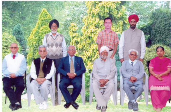
Board of Founder Trustees